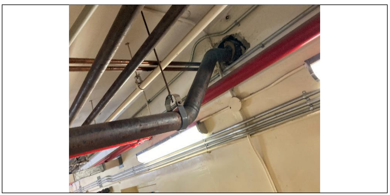
P3 - Basement Centre Corridor

Asbestos-containing pipe insulation was removed from areas of the basement.