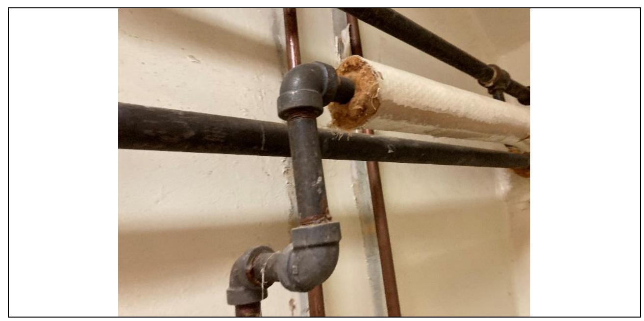
P4 - Pipe Insulation Removed

Asbestos-containing pipe insulation was removed from areas of the basement.